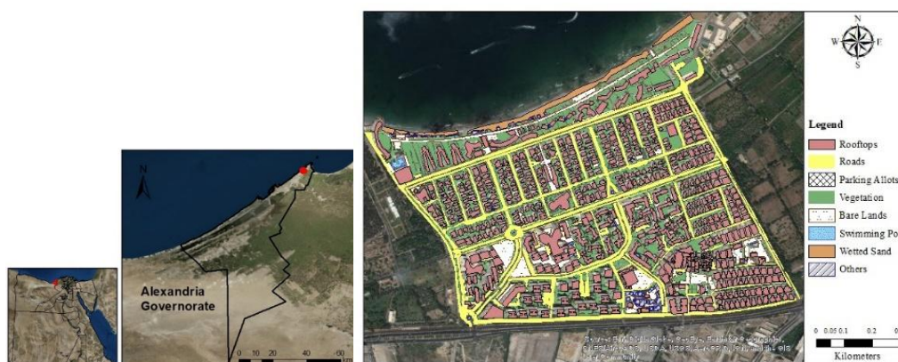
Figure 1. Location of the Mamora beach area and the digitized land use map

Figure 1, is a popular beach place with an area of 771,000 m 2 . It is located east of Montaza's royal gardens and administrated by the Governorate of Alexandria. It is considered as one of the main tourist attractions in the city for its beach and parks.