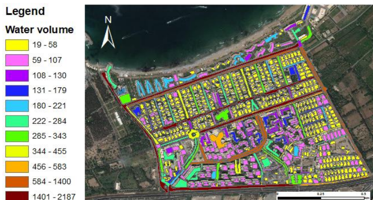
Figure 3. Spatial distribution of potential water volume( \text{m}^3 ) from RWH of Mamora beach area

Figure 3 shows the spatial distribution of potential water volume from RWH of Mamora beach area. Roof areas have a range of 15\text{-}4,500 \text{ m}^2 which can harvest 2\text{-}575 \text{ m}^3/\text{year} of water for the design rainfall.