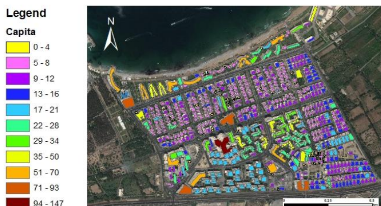
Figure 4. Spatial distribution of the potential number of people who could utilize RWH of Mamora beach area only for drinking purposes