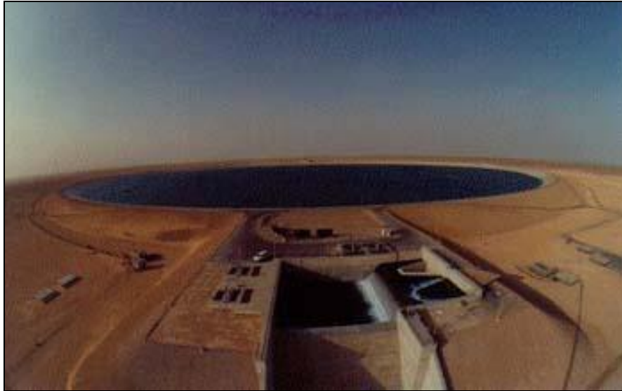
Figure 1: Omar Muktar Reservoir