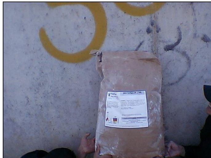
Figure 2: WaterSavr™ against reservoir 50

An evaporation retardant product, WaterSavr™, was used which is a new surface water evaporation control product, Figure 2.