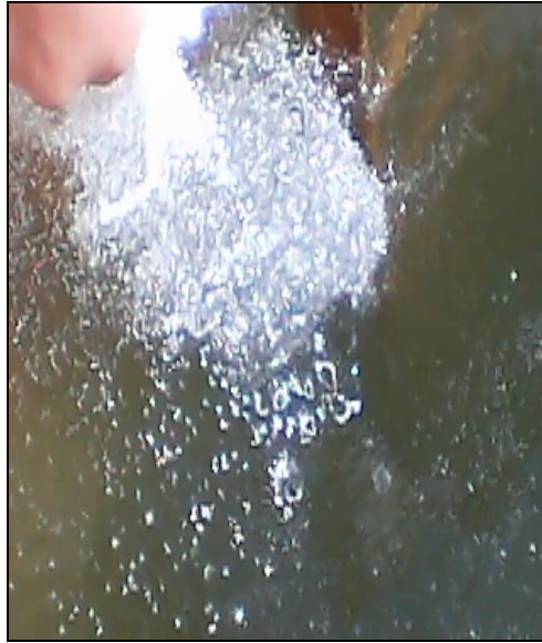
Figure 5: Application of WaterSavr™ to the reservoir no. 50.