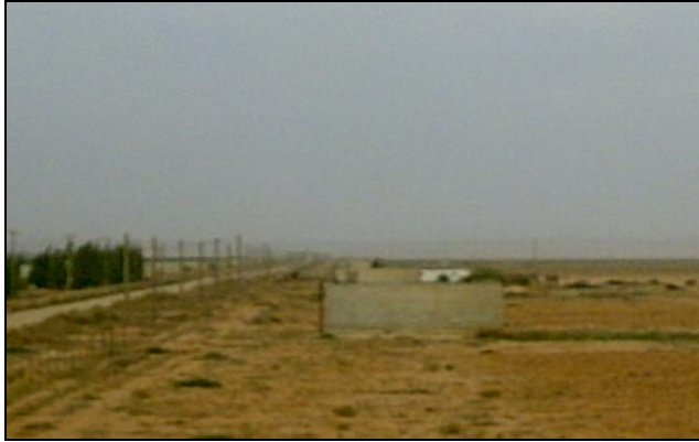
Figure 3: Reservoirs 50 & 51 in a row

Two identical agricultural open water reinforced concrete reservoirs, which are located in two adjacent farms numbers 50 and 51 in Sloque agricultural project, were used in the testing procedure of the WaterSavr™ product, see Figures 3 and 4.