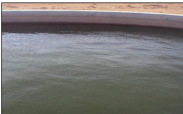
Figure 6: Growth of algae is not visible in tank 51