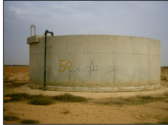
Figure 4: Reservoir 50

Each reservoir has the following characteristics: a volume of 275 m 3 , with a surface area of 10 m in diameter, and depth of 3.5 m. The following table locates the exact position of the two reservoirs; they are labeled with respect to the farm number that they are located on.